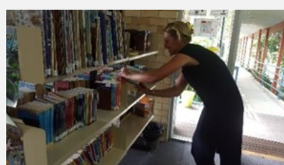
Cleo's mum has hidden a note!