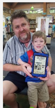
Eston created a wanted poster