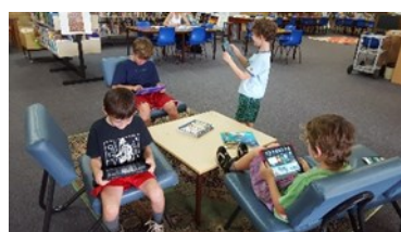
Which app had these kids enthralled?