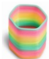
Wiggly Glow Worm