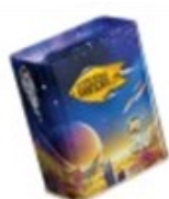
Outer Space Savers Money Box