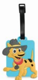
Outback Pat Bag Tag

Some great 2016 & 2015 rewards are still available!