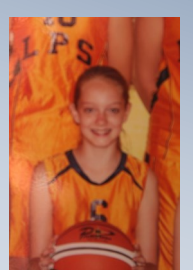
Lola T 5/6D