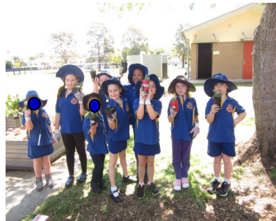
Gardening Group with Rosemary Cuttings