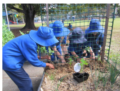
Planting Broad Beans