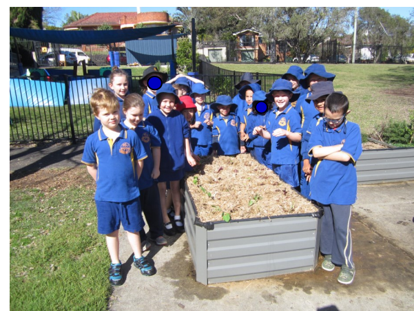
Class 1/2G who planted the beans and beetroot