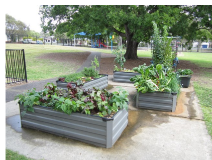
Infants' Gardens (Oct 2016)