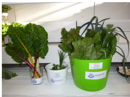
Lismore Show Entries