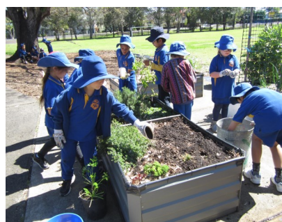
Getting ready to plant herbs