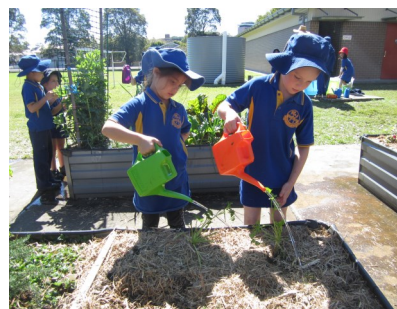
Watering (a favourite activity)