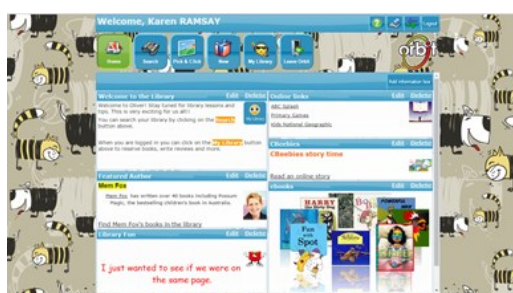
Orbit library page